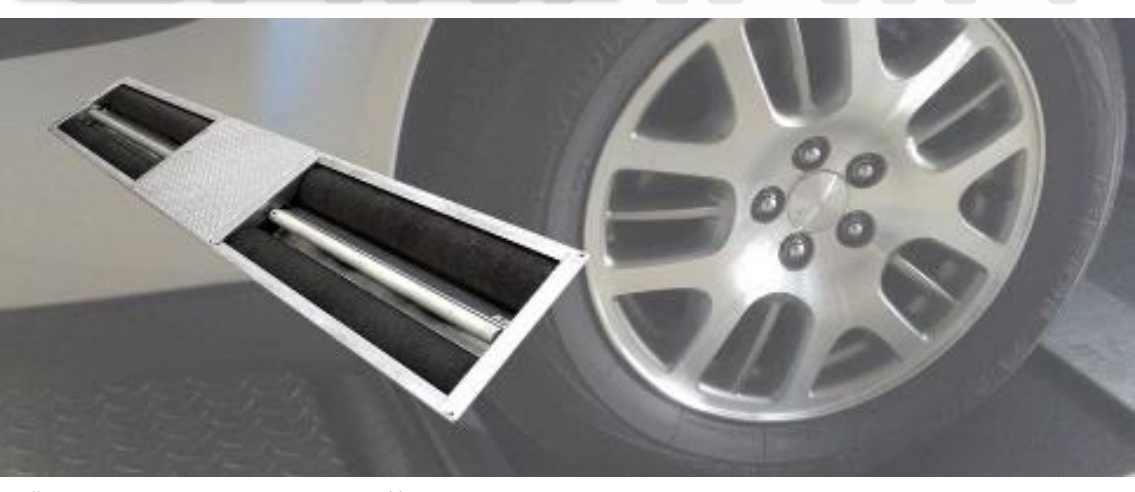
All our MOT Testing Equipment is approved by

Power supply: 2 x 5.5 kW; 3 phase, 400 V, 50 Hz