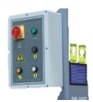
Single point, electrical safety lock release