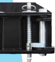
Arm locking mechanisms (compliant with EN1493)