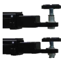
Double height screw pads