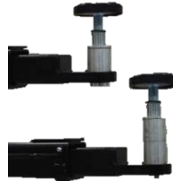
Includes 60mm & 90mm lifting pad extensions