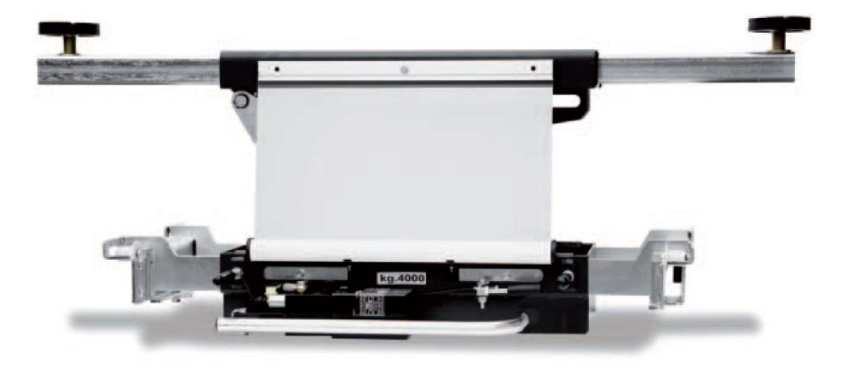
Manufactured by Werther International