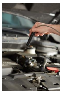
CAP1320 IR non intrusive temperature probe