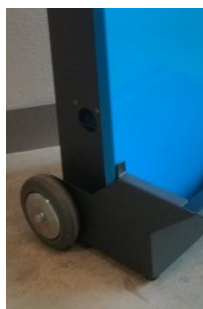
CAP3500 Wheel base