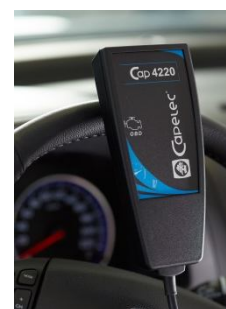
CAP4250 EOBD scantool